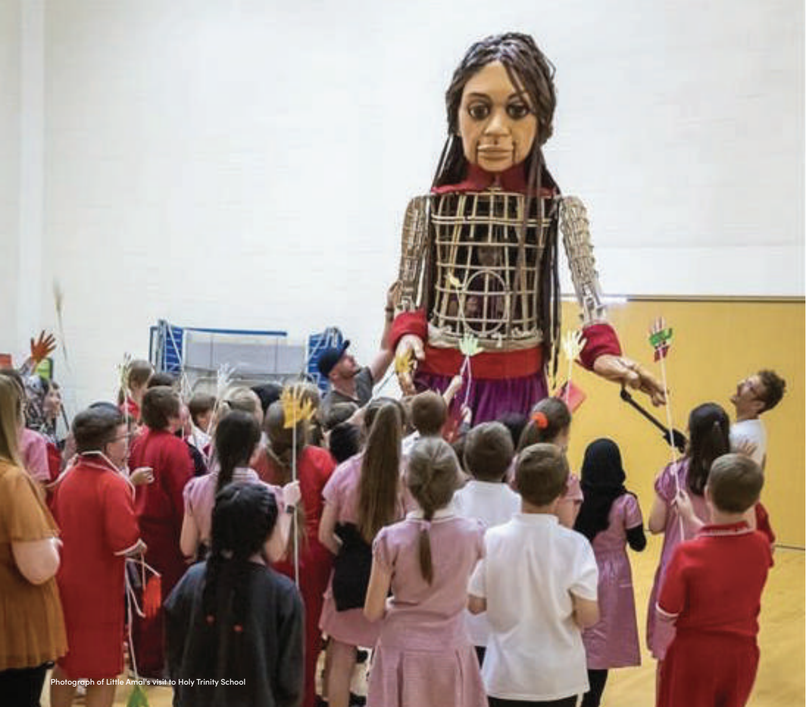
Photograph of Little Amal's visit to Holy Trinity School