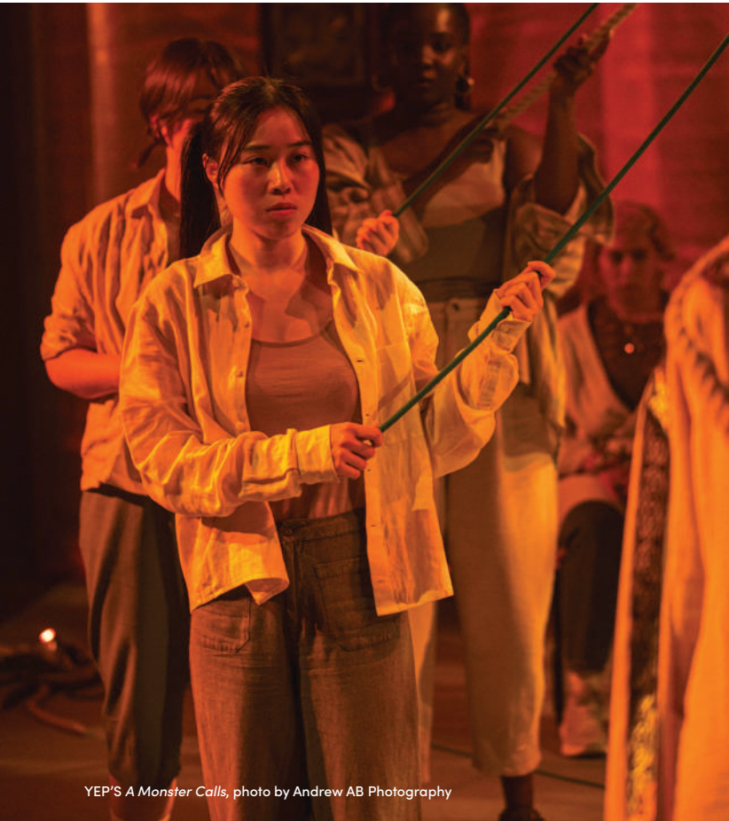
YEP'S A Monster Calls

Our theatres are a vital focus for the communities in the Liverpool City Region, telling stories which are compelling locally and nationally, supporting and attracting talent and contributing to Liverpool's reputation as one of the country's most vibrant cultural cities.